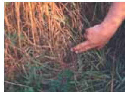
Bobwhite quail nest situated at the base of a 2-year-old bunch of broomsedge. Note how the senescent leaves from last year are used to construct the nest.