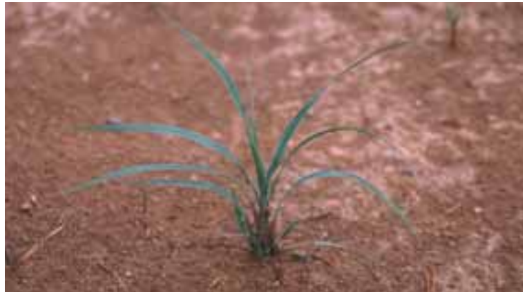
This is what you are looking for! This is a big bluestem seedling with its characteristic “fountain” appearance. Note the bare ground and lack of weeds germinating around the seedling. This is what should be expected from a properly applied pre-emergence herbicide.

Nwsg develop relatively slowly during the year of establishment. Most of the first-year plant growth is root development. Leaf and stem growth may not reach more than 2 feet high by the end of the first growing season. Typically, it is not until the second growing season that most nwsg develop considerable aboveground biomass, flower and produce seed. However, if the correct planting procedures are followed and soil moisture is not limiting, excellent growth will occur during the year of establishment, with considerable aboveground biomass and extensive flowering.