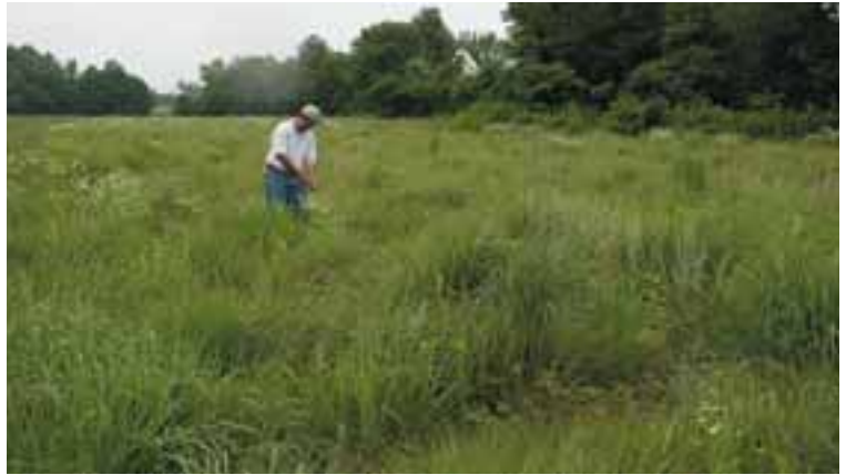
Short mixtures of nwsg usually are dominated by little bluestem, broomsedge and/or sideoats grama. These stands can provide excellent cover for nesting, brooding and foraging.

Species and mixtures for livestock forage are generally determined by preference and potential problems with competitive weeds. For example, pure stands of switchgrass or eastern gamagrass can provide excellent forage for livestock. However, if crabgrass and/or johnsongrass are prevalent, a mixture of big and little bluestem and indiangrass might be a better choice, because an imazapic herbicide can be used to help ensure successful establishment.