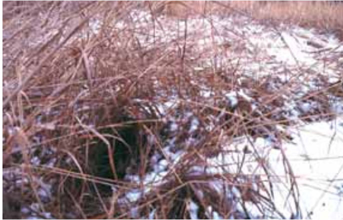
Taller nwsg species (e.g., big bluestem, indiagrass and switchgrass) provide excellent cover in winter because their stems “lodge,” creating usable space for wildlife. Here, a rabbit finds a winter home. This type of structure is not available in cool-season grass fields.

is at a premium. Tall nwsg, such as big bluestem, indiagrass and switchgrass, are especially valuable as their stems “lodge” (remain somewhat upright, leaning against each other), continuing to provide cover even after winter rains, snow and wind. Deer seek out nwsg fields on cold, clear days because they can remain hidden in the tall grasses, yet are able to absorb the sun’s warm rays. In low-lying bottomlands that periodically flood in winter, fields of switchgrass (especially the Kanlow variety) can attract large numbers of ducks when shallowly flooded.