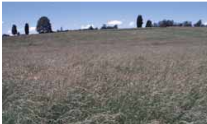
Fields of tall fescue are common throughout the Mid-South. This is poor wildlife habitat and, for many species, it might as well be covered in asphalt.

There are many problems associated with tall fescue and other perennial cool-season grasses, both for wildlife and livestock. Problems for livestock are associated with an endophyte fungus found within tall fescue that is highly toxic. Cattle consuming tall fescue (either grazing or as hay) often experience poor weight gains, reduced conception rates, intolerance to heat, failure to shed the winter hair coat, elevated body temperature and loss of hooves. Problems with horses are more severe, especially 60–90 days prior to foaling. Fescue toxicity in horses often leads to abortion, prolonged gestation, difficulty with birthing, thick placenta, foal deaths, retained placentas, reduced (or no) milk production and death of mares during foaling. As a forage, tall fescue and other perennial grasses (e.g., orchardgrass) are