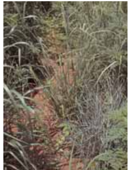
This is what a field planted for wildlife should look like in early June. Sparse nwsg, abundant forbs (ragweed, partridge pea) and open ground space provide the optimum structure for brooding and a seed source for fall and winter.

An open structure at ground level also enables the seedbank (seed in the top few inches of soil) to germinate. Arising from the seedbank are plants such as ragweed, blackberry, partridge pea, beggar’s-lice, pokeweed, native lespedezas and annual sunflowers. Forb cover is critical in making a field of nwsg most attractive to wildlife. These plants provide an excellent canopy of brood-rearing cover for quail and wild turkeys; quality forage for deer, rabbits and groundhogs; and later produce seed and soft mast that is an important source of energy through summer and into fall and winter for many wildlife species. Scattered brush and small trees also can make a field of nwsg and associated forbs more attractive to wildlife, particularly bobwhites and several spe-