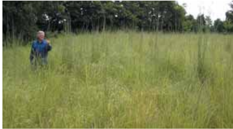
Tall mixtures of nwsgr usually include some combination of big bluestem, indiagrass and switchgrass. These stands can provide excellent cover for nesting, brooding and foraging, as well as winter and escape cover.

Tall mixtures provide cover for ground-nesting birds, as well as those that nest above-ground (e.g., dickcissel, field sparrow, Henslow's sparrow and red-winged blackbird). Tall mixtures also provide excellent cover for brood rearing and escaping predators.